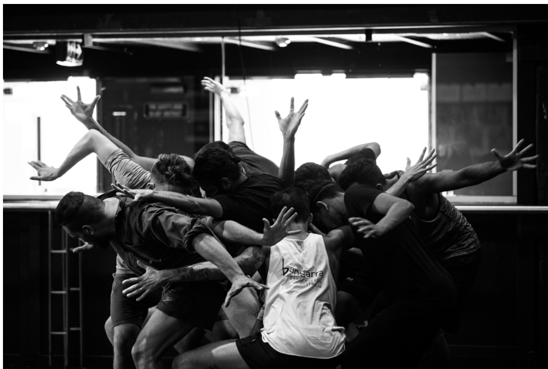
Bangarra Dance Theatre ensemble in rehearsal for Bennelong

Please refer to page 10 for further reading and resources regarding Bennelong and the people and events related to his story.