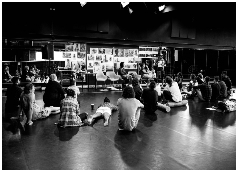
Bangarra Dance Theatre ensemble in rehearsal for Bennelong

As the process developed, many aspects of the story became ever more fascinating and the aim to create meaning beyond the commonly known narrative became more of an imperative.