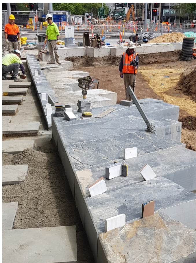
Stone installation between Dodds Street and Sturt Street

Construction of the open space area at the front of the Melbourne Recital Centre and Southbank Theatre is progressing. Concrete footings have been poured, and stone installation has commenced, along with tree and ground level planting.